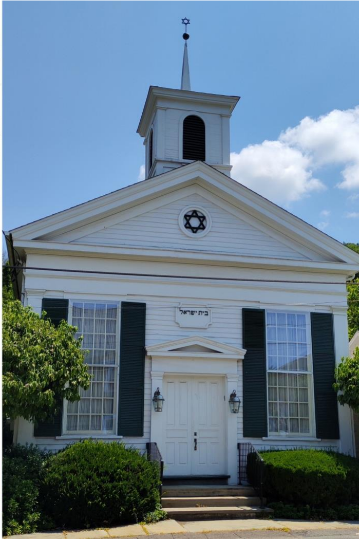
Congregation Beth-Israel – Honesdale, PA