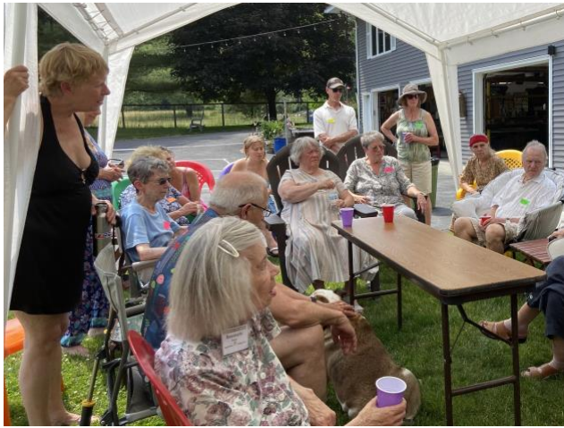
A little shade to escape the bright sun